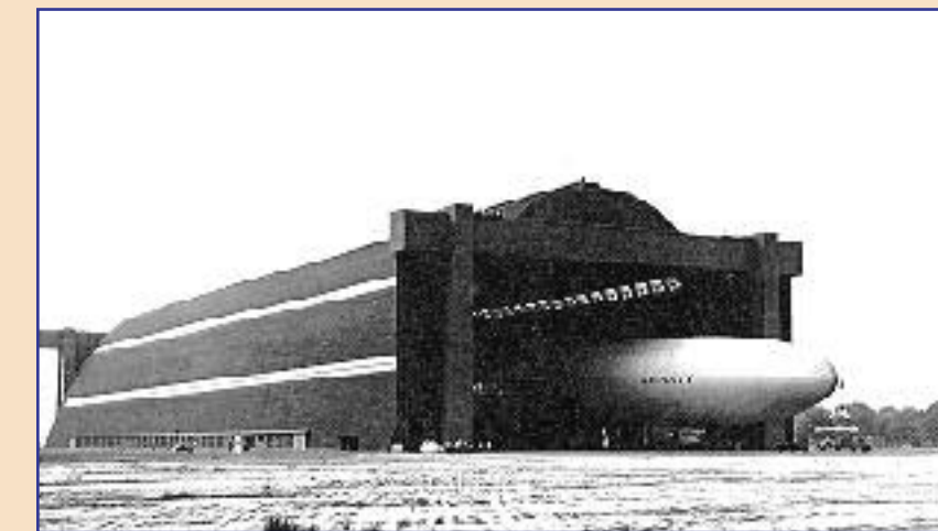
1943 Airdock #2 construction completed (former TCOM hangar)