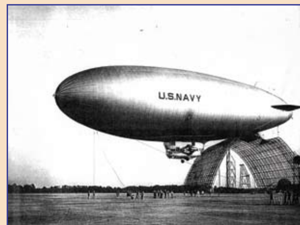
1942 Weeksville Naval Air Station (current TCOM site) commissioned and began operations